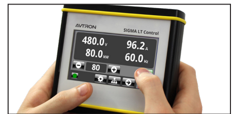
Optional SIGMA LT Hand-Held Controller.